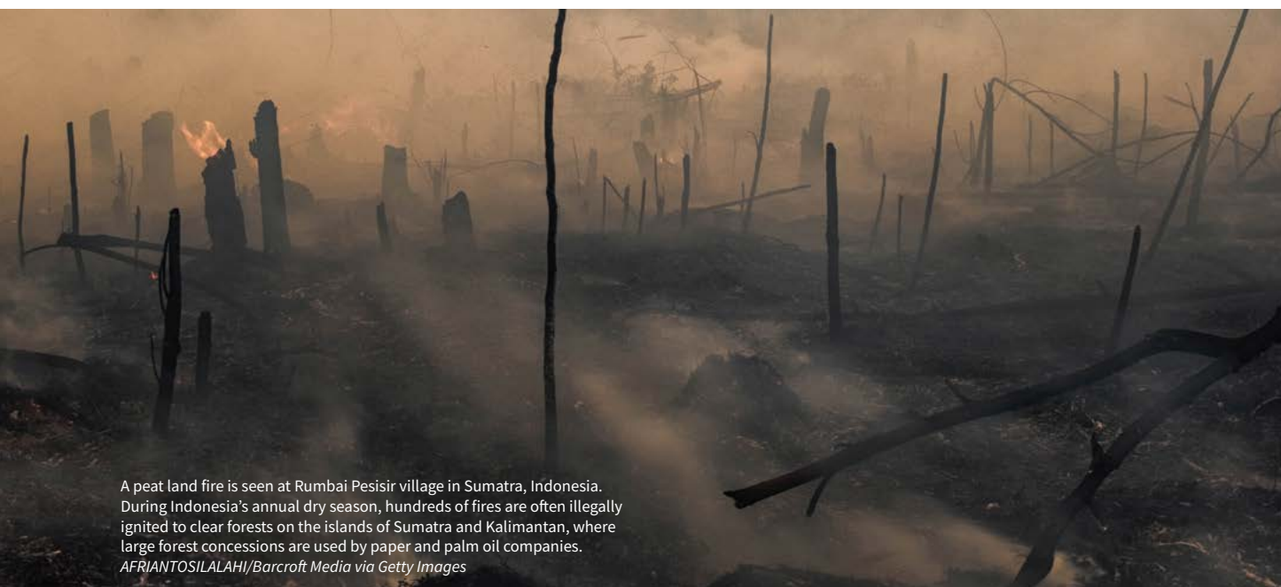
A peat land fire is seen at Rumbai Pesisir village in Sumatra, Indonesia. During Indonesia's annual dry season, hundreds of fires are often illegally ignited to clear forests on the islands of Sumatra and Kalimantan, where large forest concessions are used by paper and palm oil companies.