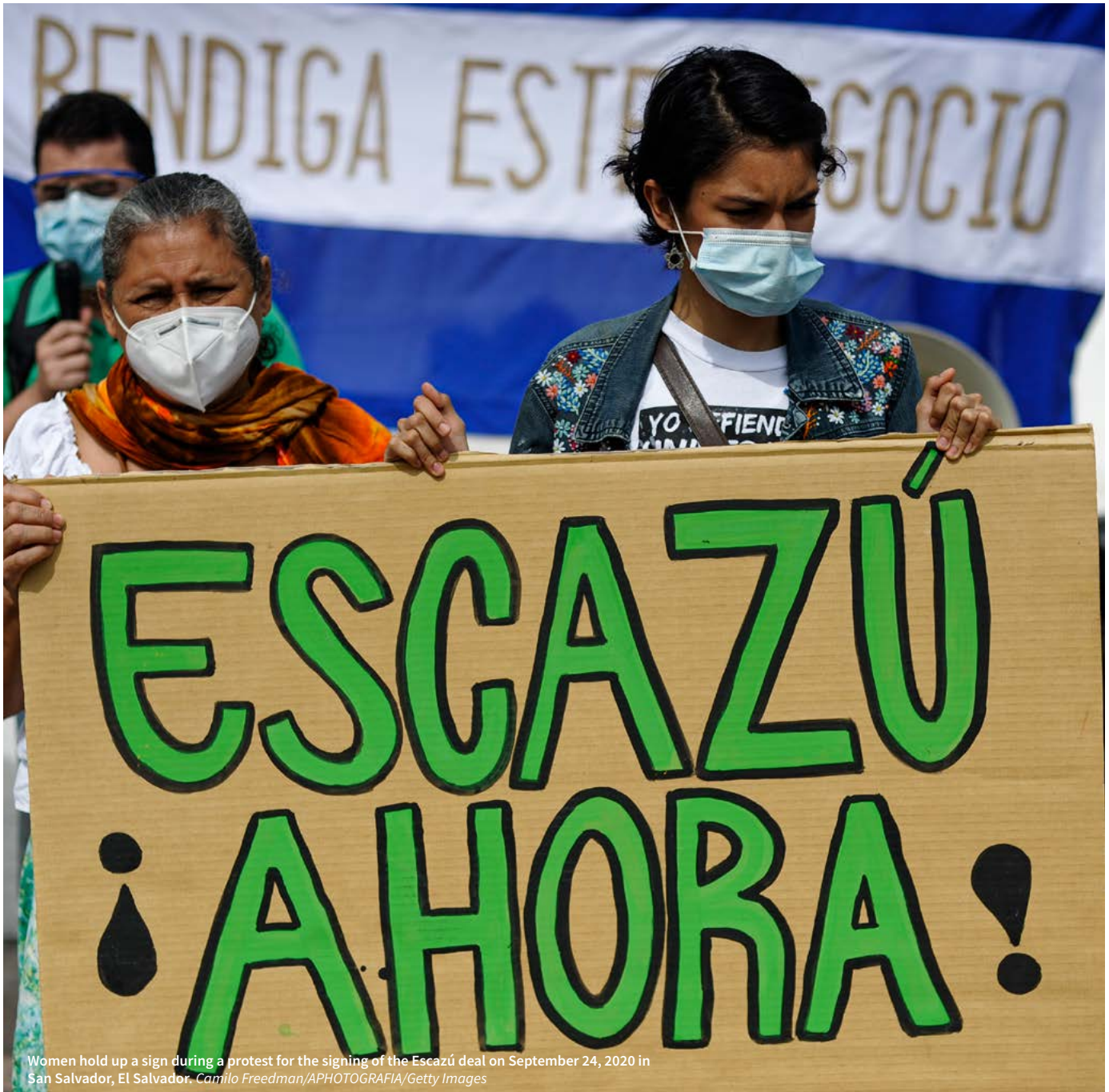
Women hold up a sign during a protest for the signing of the Escazú deal on September 24, 2020 in San Salvador, El Salvador.

In a promising development, on the 5th November Mexico became the 11th country to ratify the landmark Escazú Agreement for Latin America and the Caribbean – meaning it has now come into effect. The regional treaty sets out commitments for public participation in environmental management and standards for access to information and decision-making on environmental matters. Crucially, for the worst affected region it establishes legally binding commitments for protecting environmental defenders – the first time this has been included in an agreement of this kind.