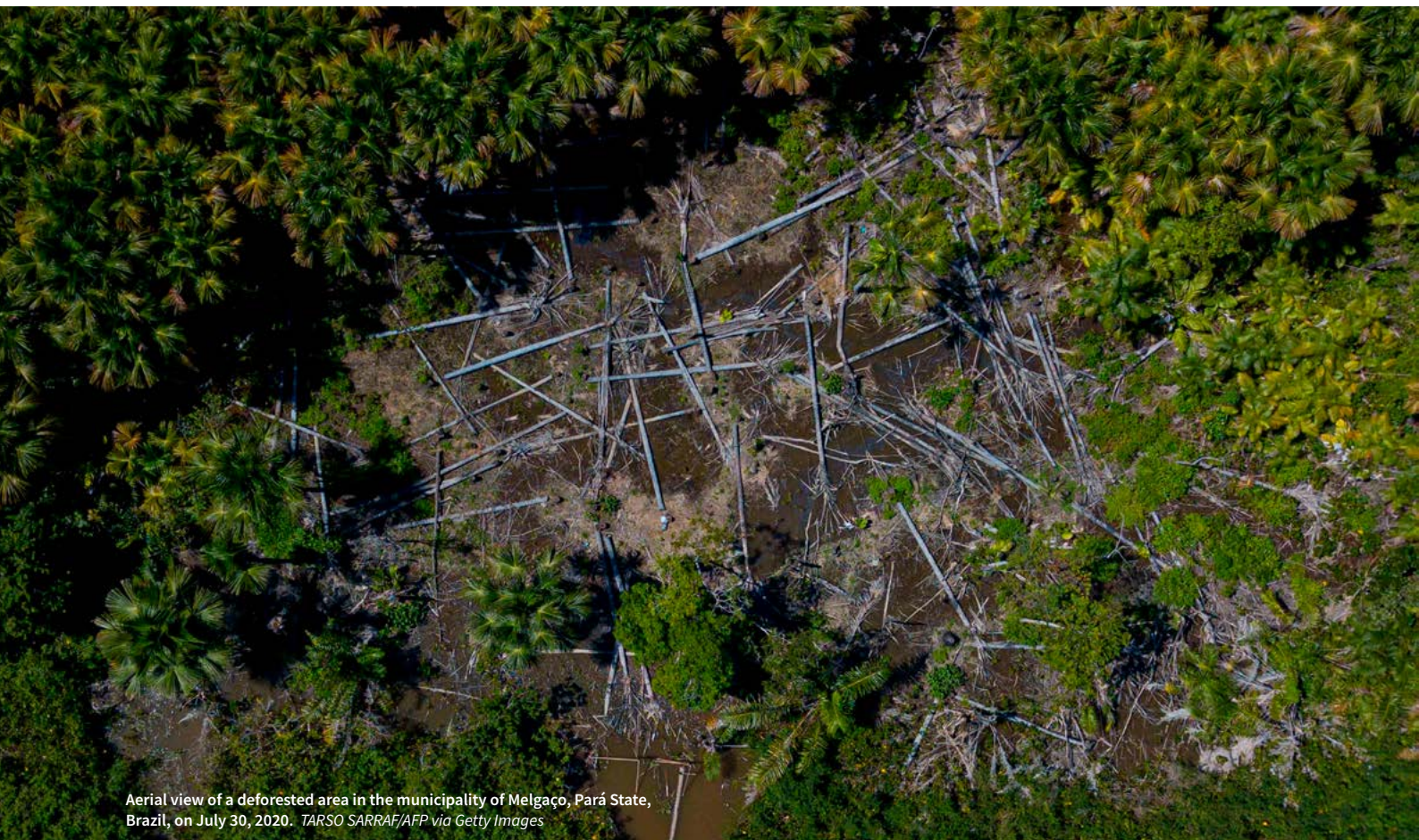
Aerial view of a deforested area in the municipality of Melgaço, Pará State, Brazil, on July 30, 2020.

* We define land and environmental defenders as people who take a stand and peaceful action against the unjust, discriminatory, corrupt or damaging exploitation of natural resources or the environment. For more detail, see our methodology on page 27.