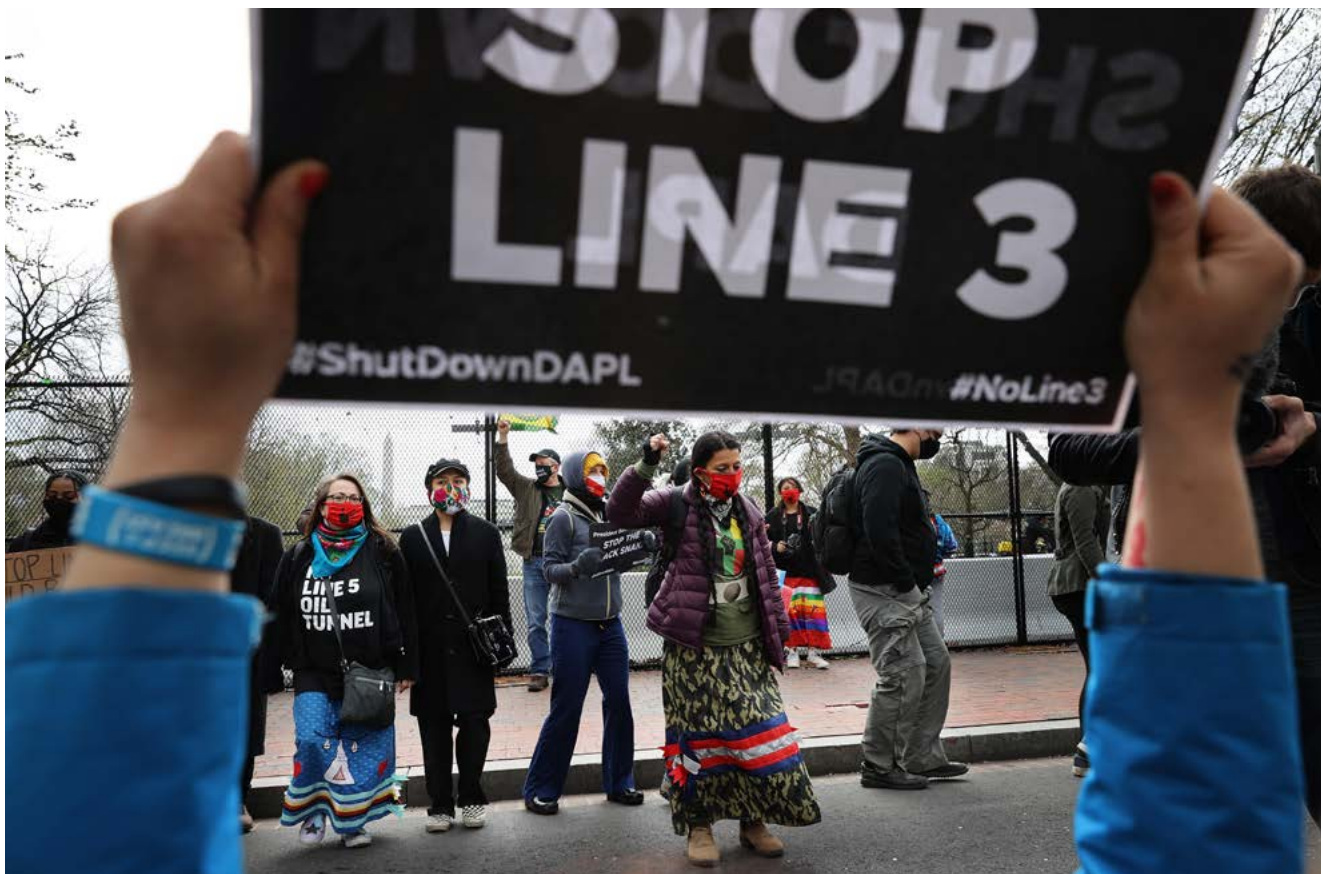
Indigenous environmental activists dance in a circle outside the White House to protest against oil pipelines. Organized by the Indigenous Environmental Network, the demonstrators called on President Joe Biden to ‘Build Back Fossil Free’ by stopping the Dakota Access and Line 3 pipelines.