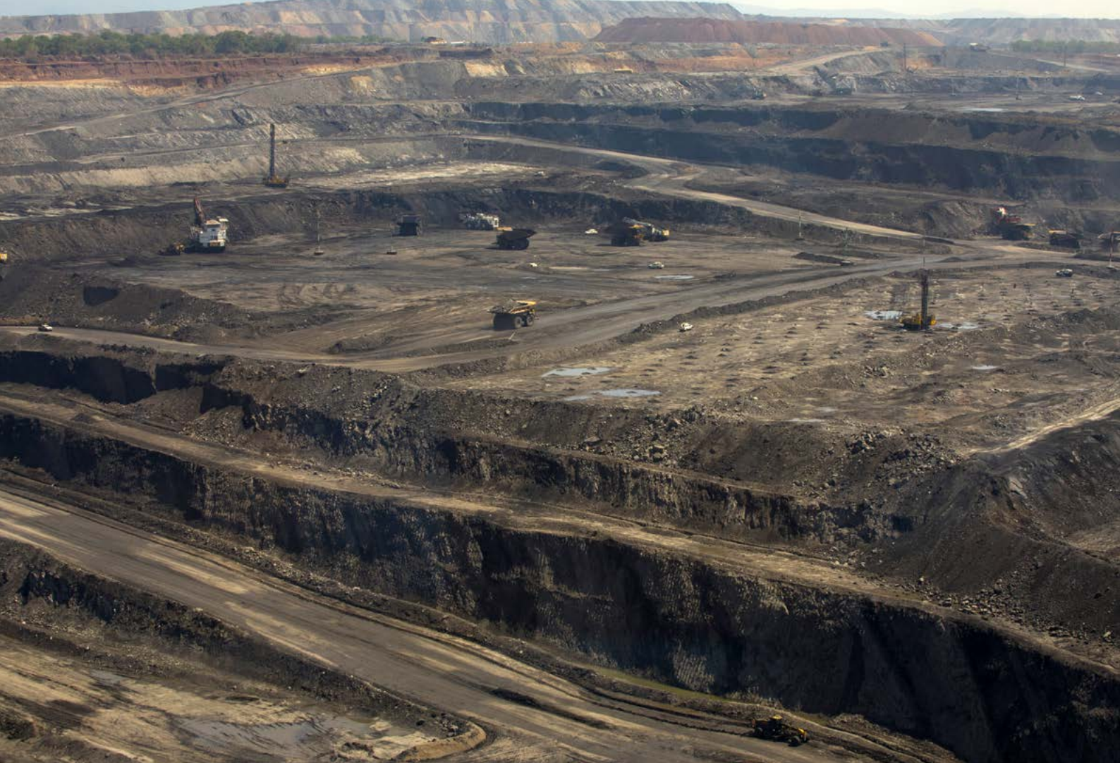
Machinery operating in the annex pit at the Cerrejon Coal Mine in Barrancas, La Guajira, Colombia.