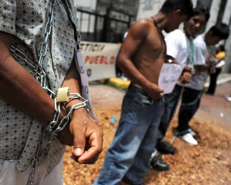
Indigenous Naso campaigners stand chained to each other during a protest outside the Presidential Palace in Panama City in 2009. The Naso have been calling for formal land rights recognition for decades.

doubt – including the Keystone XL pipeline. However, indigenous communities and climate campaigners have continued to face criminalisation and police violence for their protests against the Enbridge 3 pipeline. 35